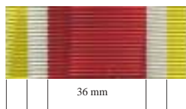
Germany Lippe-Detmold OEK 275, Commemorative Medal for the 1866 Campaign, yellow-white-red-white-yellow, but this ribbon had been at no time 27 mm wide!